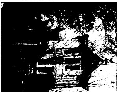
This P Street house is listed at $2,200,000.

have used this large side yard as a place to grow flowers.